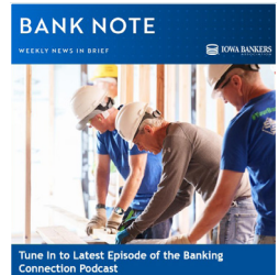
This week, the IBA released the second episode of the Banking Connection Podcast . Partner Profiles , a monthly podcast to introduce the IBA's member partners and highlight the collaborative work being done to make Iowa a better place. In this